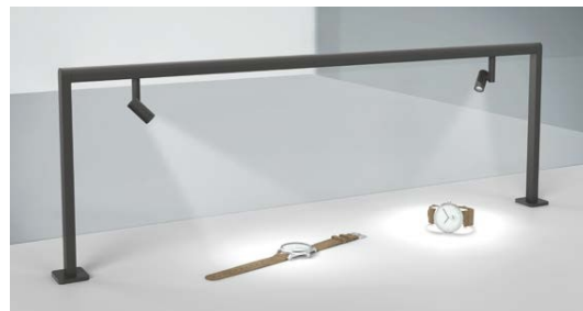
LED 2-Link Showcase Profile

New Hera LED-2-Link offers the perfect combination of Linear, Flood and LED Spot lights to ensure the best lighting coverage in display cases and shelving applications.