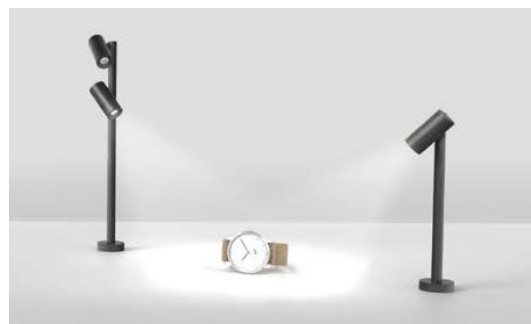
Rotate and Swivel LED spotlight

Special lighting solutions are provided by this highly effective and bespoke system.