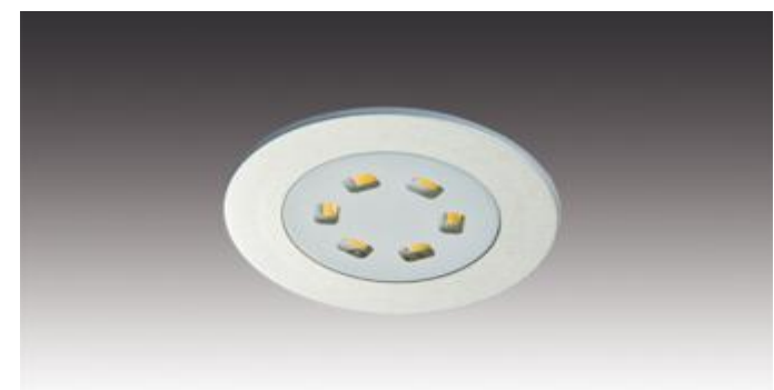
For further information click \underline{\mathsf{HERE}}